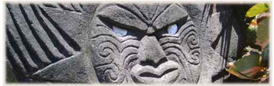
stone carving showing tropical sun / moonrise over Muri Lagoon

translated with the dictionary written by Jasper Buse und Raututi Taringa that has been edited by Bruce Biggs and